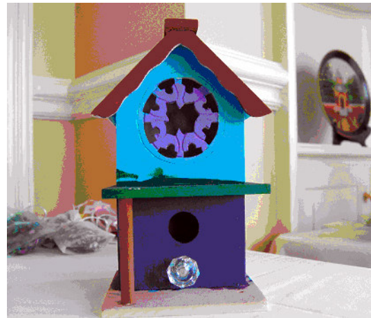
Residents' artwork for sale at the Annual Meeting