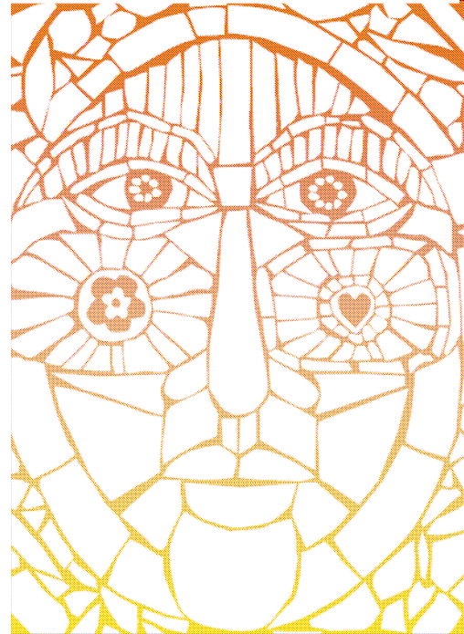
Mosaic Expressions of The Children's Home

"We have witnessed a rapid growth in the FACES event over its first three years. The people of the greater Baltimore area are enjoying the event with its unique theme and appropriate location. They are also embracing the mission of The Children's Home to provide the hope and security that children need and deserve. Enjoyment combined with a purpose creates a very special evening."