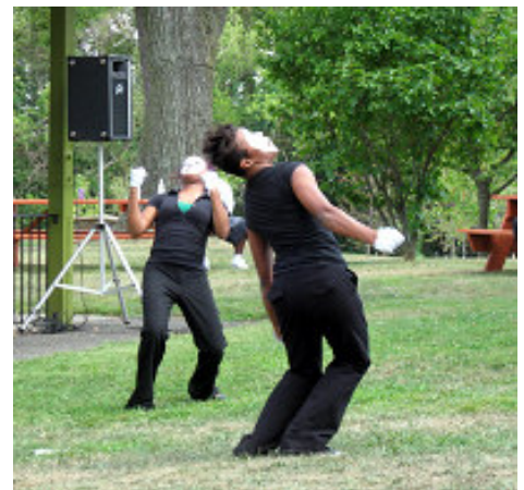
Silent Voices Dance Ministry from Morningstar Baptist Church