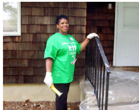
A hearty worker from Erickson Retirement Communities