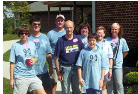
The crew from Christian Temple

The Children's Home is blessed by our location in a community that believes in the spirit of volunteering. During the past months, the campus has been host to two active organizations whose members or associates enjoy the hands-on activity of philanthropy.