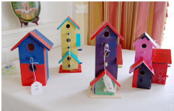
Birdhouses painted by TCH residents available for purchase at the 2008 Annual Meeting.