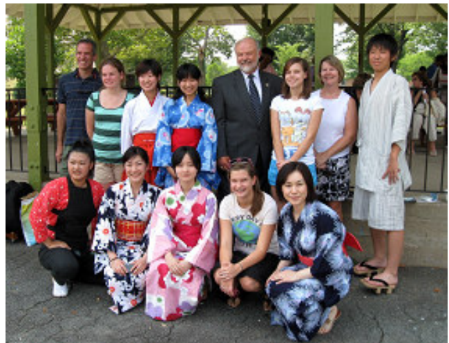
Little Adventure Program visiting from Kanagawa Prefecture, Japan, as part of the Maryland Sister States program.